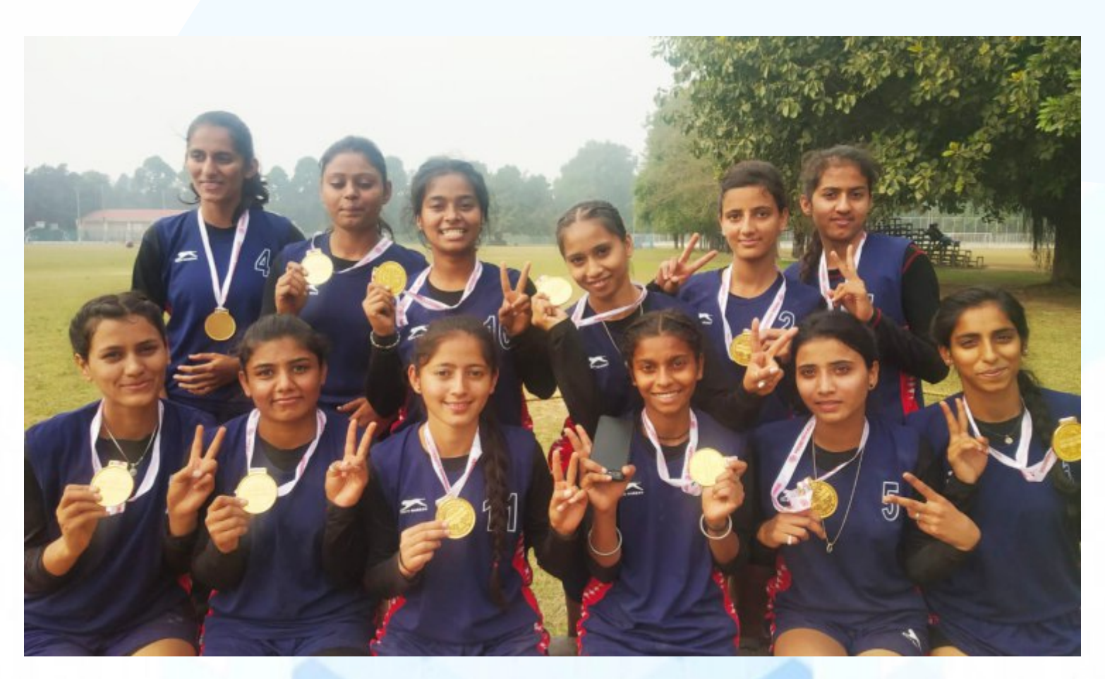
Golden Girls of The College

NOTE: All Admissions will be Provisional and subject to Scrutiny of the Admission Form and Verification of Original Documents (Online)