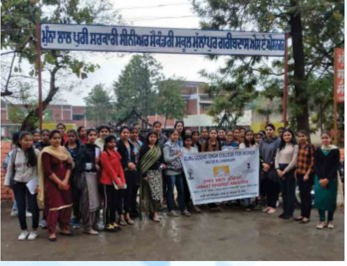
Unnat Bharat Abhiyan- A step towards better future

Admission of the candidate with a compartment, as indicated above, shall be provisional and will be confirmed only after he/she has cleared the compartment in two consecutive chances subsequent to his/her admission. In case the candidate does not clear the compartment at any of the two consecutive chances allowed to him/her subsequent to the date of his/her admission, his/her provisional admission to the course shall stand cancelled.