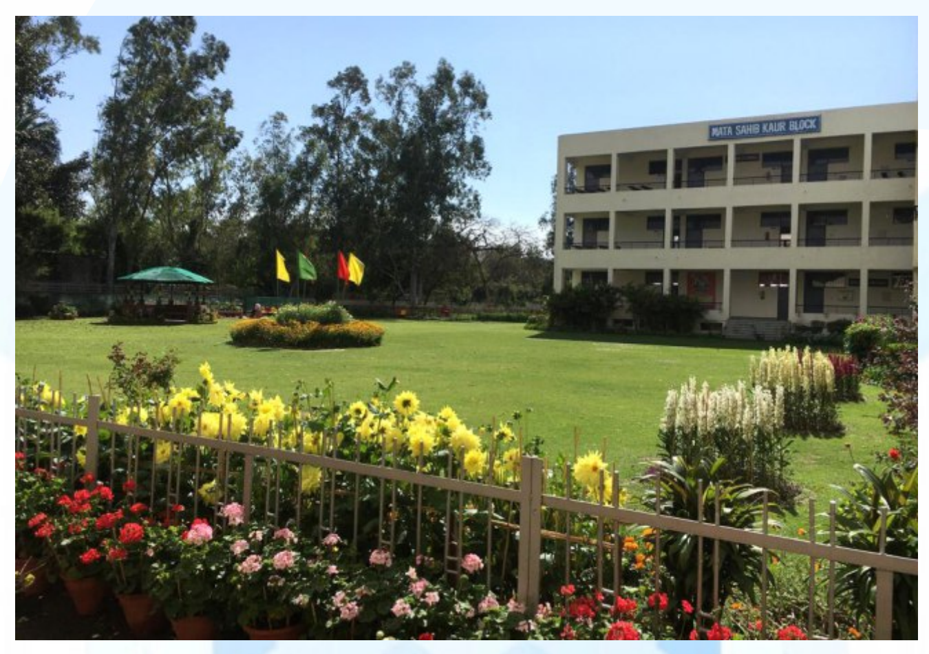
Best Maintained Campus in Chandigarh since 2008

Ranked as one of the pre-eminent institutions of the region, the College is affiliated to Panjab University and is NAAC reaccredited. The College is located in the prime area of Sector 26, Chandigarh with other educational institutions in the vicinity, which offers environment for academic enrichment. The College Campus is easily accessible and is well connected with city transportation services.