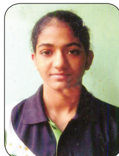
NITU (Boxing)- (1) Gold medal in World Championship Boxing. (2) Gold medal in International Youth Boxing Championship held at Bulgaria.