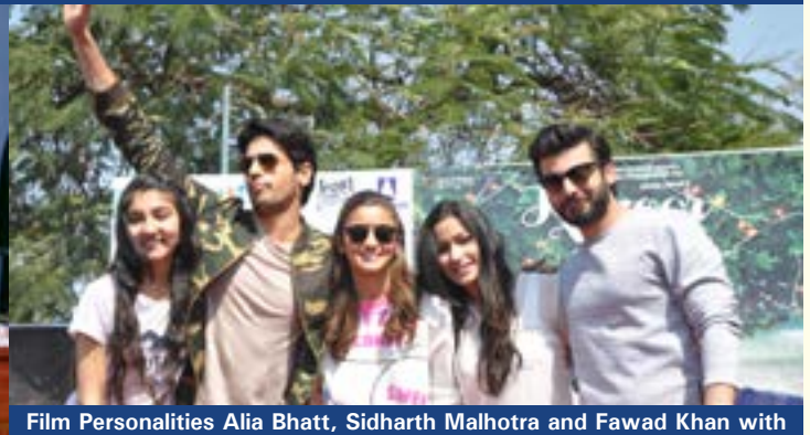
Film Personalities Alia Bhatt, Sidharth Malhotra and Fawad Khan with College students