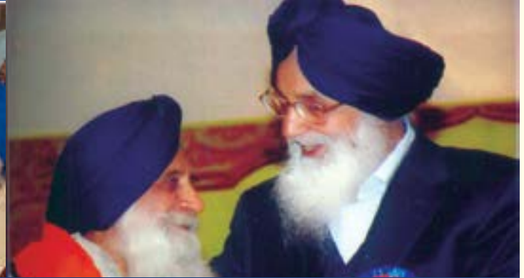
S Parkash Singh Badal, Former Chief Minister, Punjab