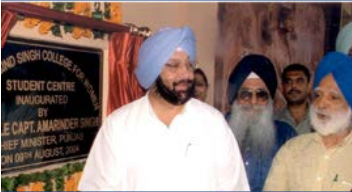
Capt. Amarinder Singh, Chief Minister, Punjab