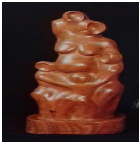
(Plate 2) Family Wood (1967) 16