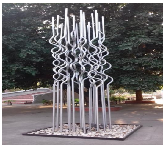
(Plate 4) Environmental Sculpture 18