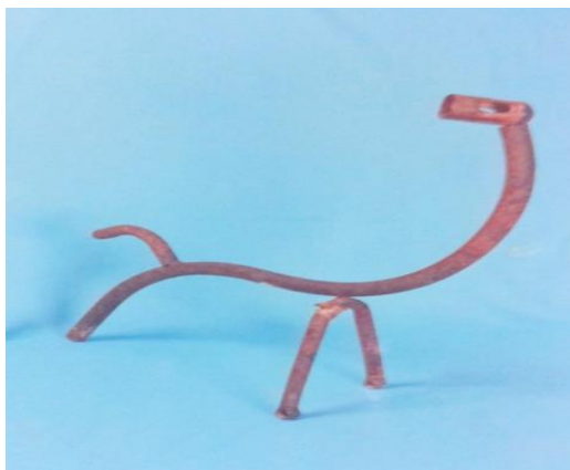
(Plate 5) Wonder, 19 Metal (1967)