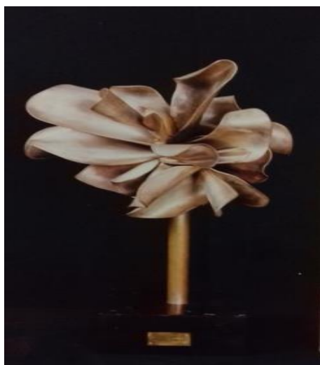
(Plate 3) Metal Flower II (1978) 17