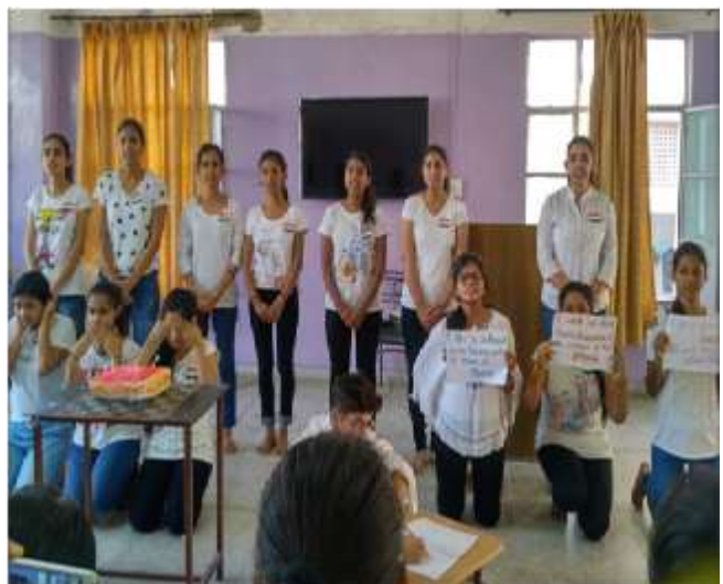
Day four (3 rd October, 2017)